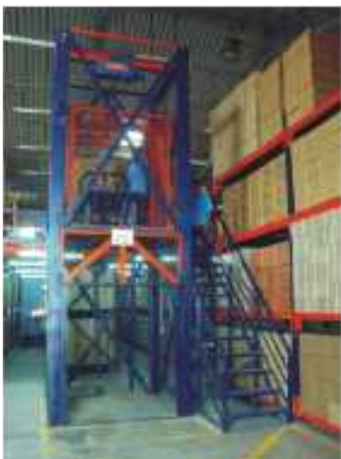
Integration with VRC