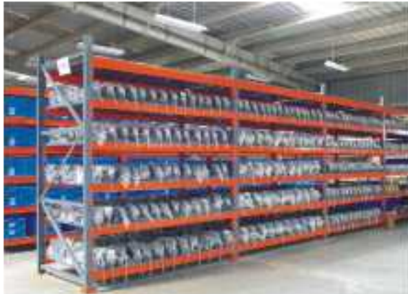
Heavy Engineering Storage