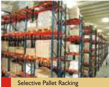
Selective Pallet Racking