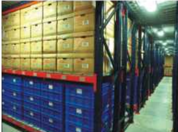
Bulk Document Storage