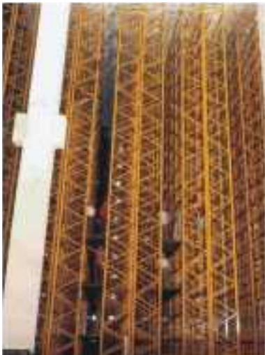
High Rise Shelving