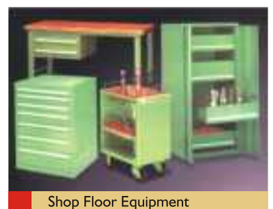
Shop Floor Equipment