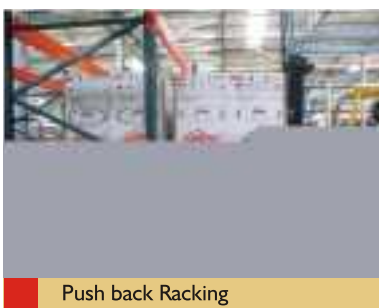
Push back Racking