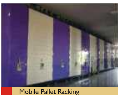
Mobile Pallet Racking